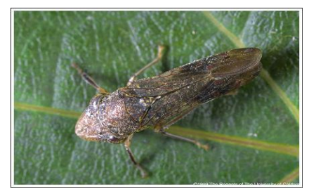
Adult Glassy-winged sharpshooter

Happy New Year! Amongst all the recent rain, GWSS numbers for January 2023 remain low with only 2 GWSS found across 2 traps. The next survey will be in February. Please see the map on page 4 for the trap locations.