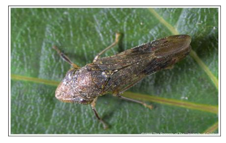
Adult Glassy-winged sharpshooter

GWSS numbers are slightly lower from the last survey with 83 GWSS, however, these are now spread across 46 traps. Numbers of GWSS are going down but they are being detected in low levels in more areas. Please see the map on page 4 for the trap locations.