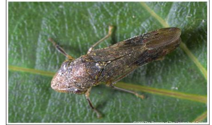
Adult Glassy-winged sharpshooter

GWSS numbers have increased with 76 GWSS across 30 traps. While it isn't a significant increase, it shows that GWSS is maintaining a sizable presence late in the summer. Please see the map on page 4 for the trap locations.