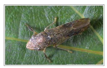
Adult Glassy-winged sharpshooter

GWSS numbers have decreased again to 18 GWSS across 15 traps. They continue their decline as we head into fall/winter. Please see the map on page 4 for the trap locations.